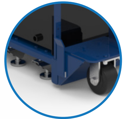
HEAVY DUTY FLOOR LOCKS